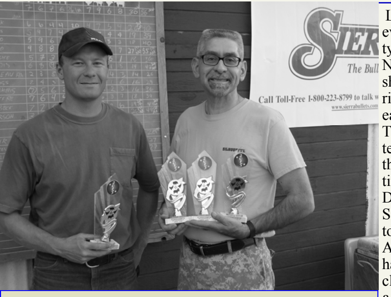
WYOMING RIFLE SILHOUETTE CHAMPIONSHIPS

Lander Valley Sportsmen's Assoc hosted the championship event Aug 22 & 23 at their range a few miles out of town. Twenty-four competitors, some with families, traveled from CO, MT, ND, and SD to join the WY shooters in battle with the animal shaped targets at distances from 44 to 550 yards. Four separate rifle category champions were determined over the weekend; each after a 2 X 40 shot program.