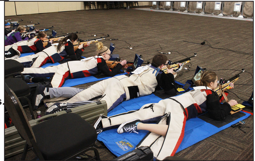
Laramie County 4-H Shooters.